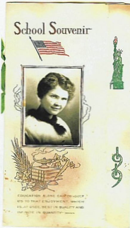
Happy Days are here again