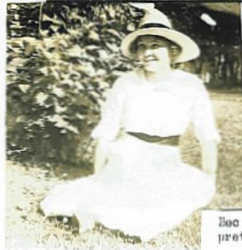
Doc sittin' pretty