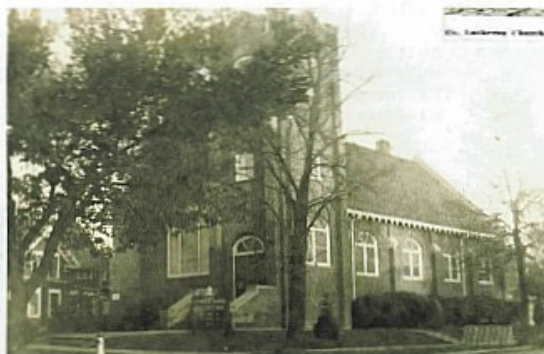
St. Lawrence Church