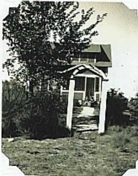
House on the Eighty