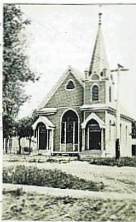
St. Lawrence Church, Morris, Minn.