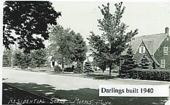
Darlings built 1940